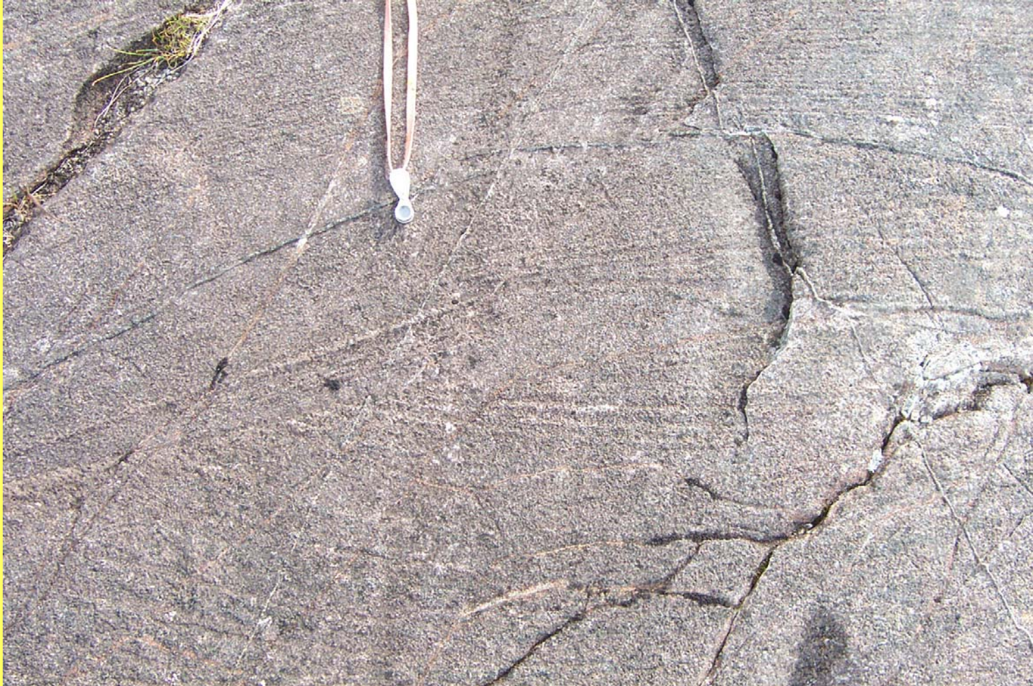
Layered gabbro, Mull, Scotland (Elkins-Tanton, 2005)