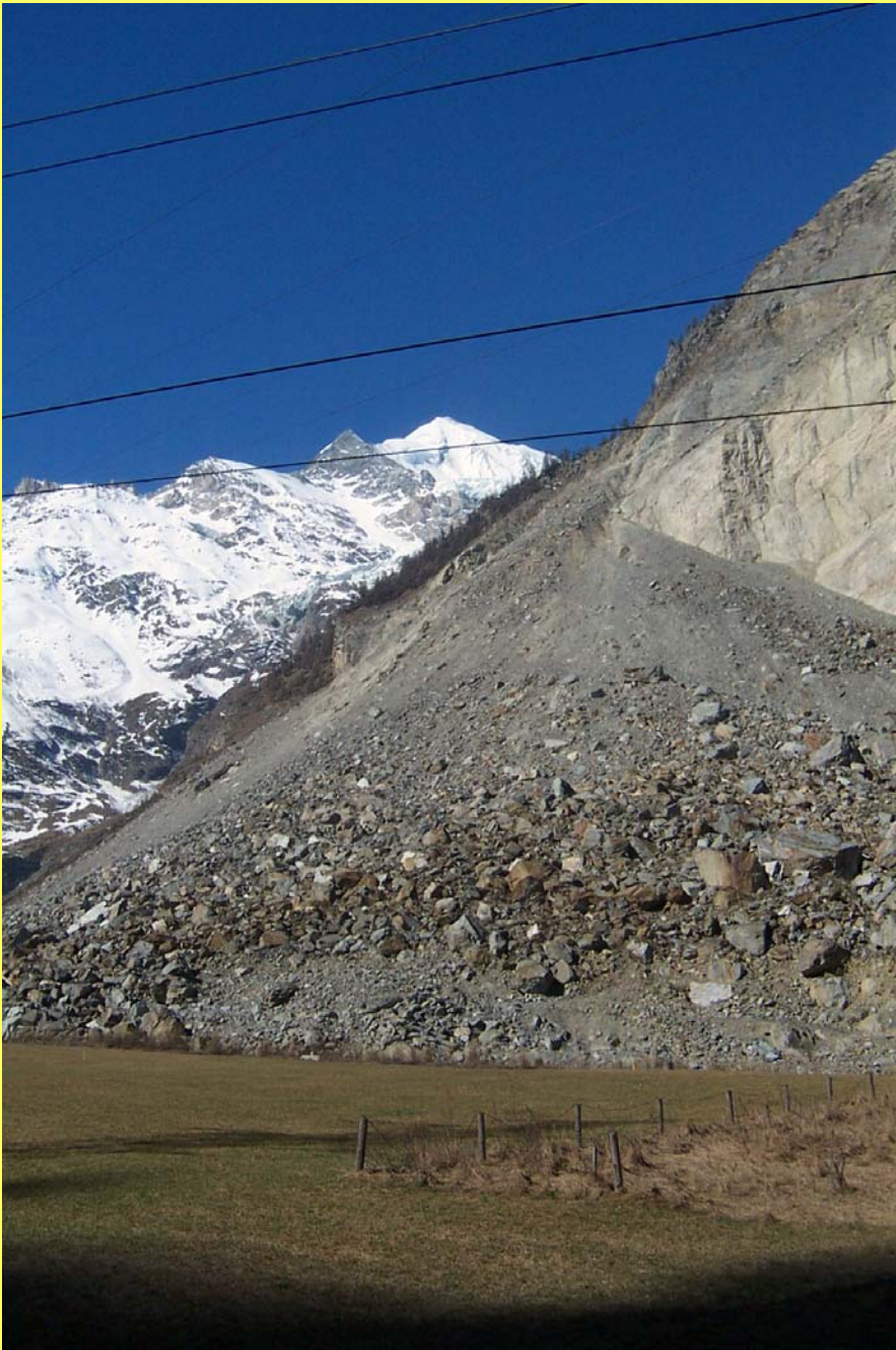
Debris flow, Swiss Alps near Zermatt