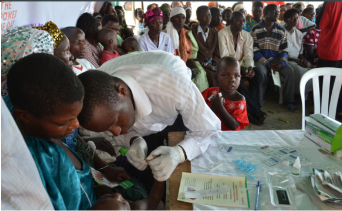
Women and children in rural Uganda look on as the service provider from a nearby health center provides malaria tests for communities on the lake's edge.

important time associated, rather than a product with a simple sales transaction. Framing the business opportunity as a service rather than a product may be critical for increasing mRDT availability.