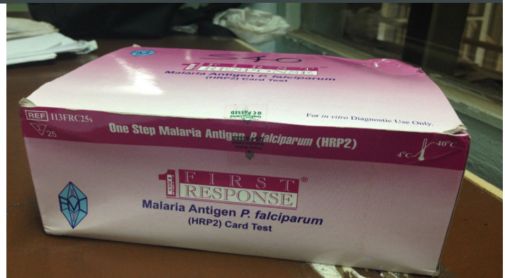
A one-step malaria rapid diagnostic test.

These results show that the highest value option for one agent